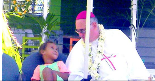
Never too young to start...by one on one conversation