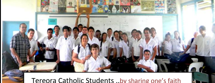
Tereora Catholic Students ..by sharing one's faith