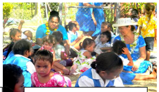
New Pre-school Centre Blessed