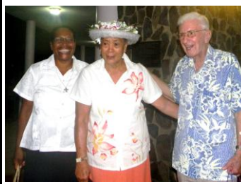
After Mass at Cathedral