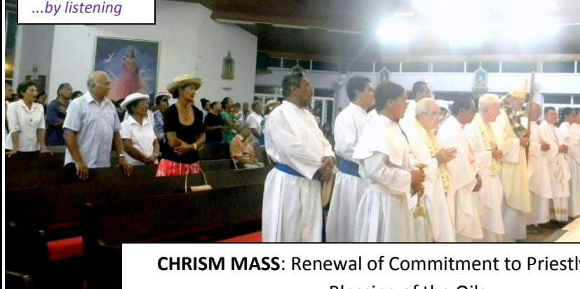
CHRISM MASS: Renewal of Commitment to Priestly Service, Blessing of the Oils