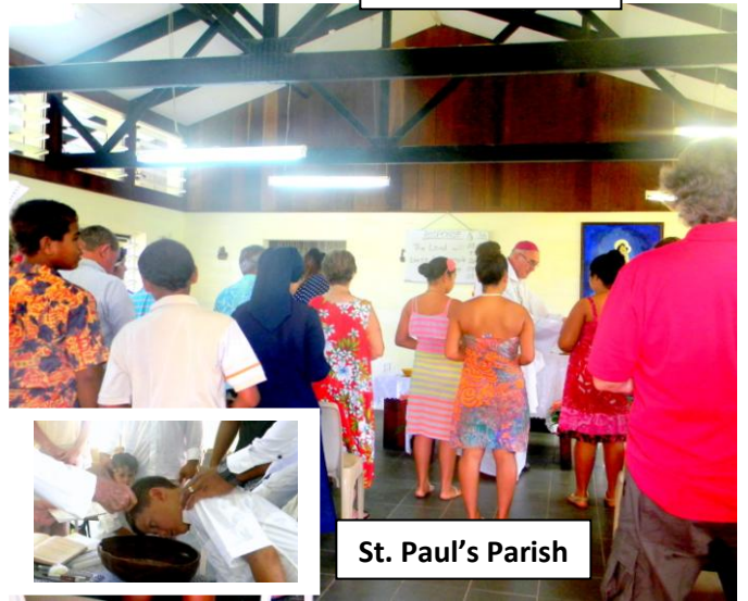
St. Paul's Parish