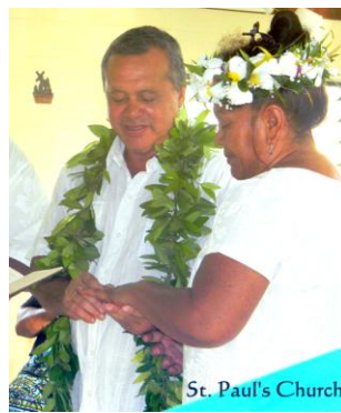
St. Paul's Church