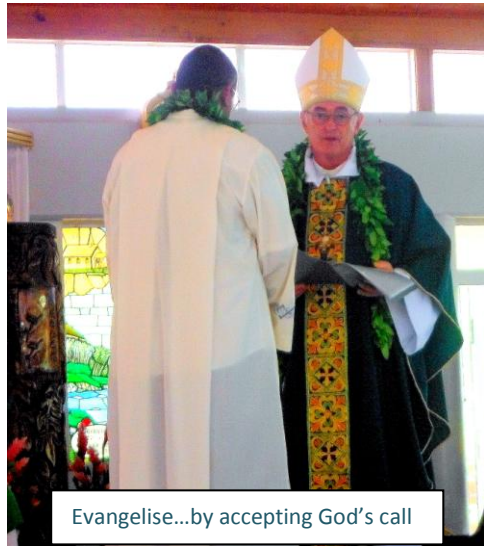
Evangelise...by accepting God's call